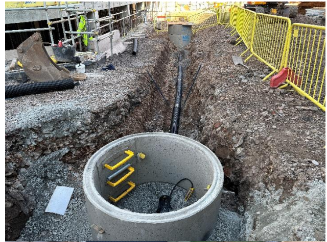
Infrastructure works have commenced

*Prefabricated MEP (Mechanical, Electrical, and Public Health) risers are custom-built, factory-engineered vertical service modules. Designed for multi-story buildings, they combine piping, conduit, and ductwork into single, pre-assembled steel frames that dramatically accelerate on-site installation and improve worker safety.