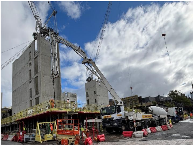
Concrete pump being used in Zone 3