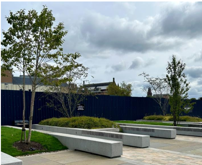
Hoarding installation along St Mungo Square