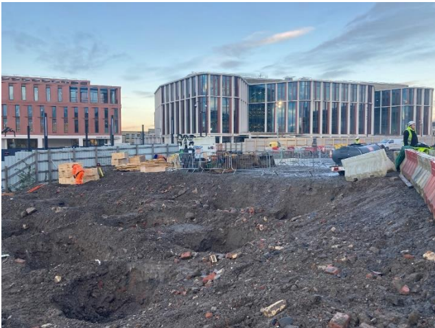
Foundations being prepared for new welfare