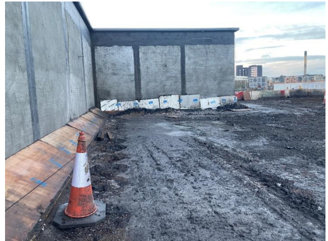
HV switchroom following cladding removal