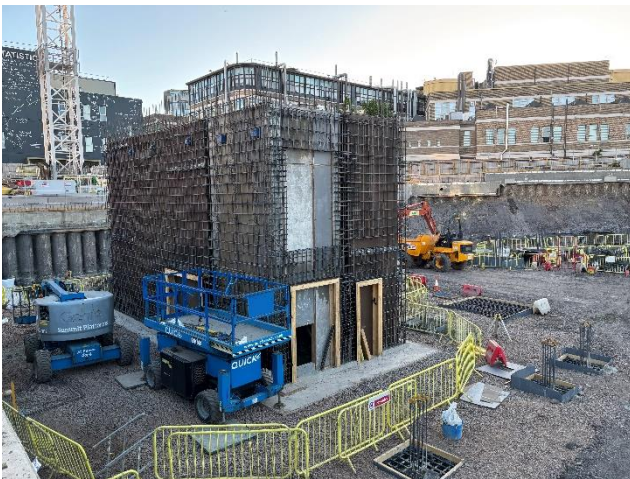
Progression of the first core wall