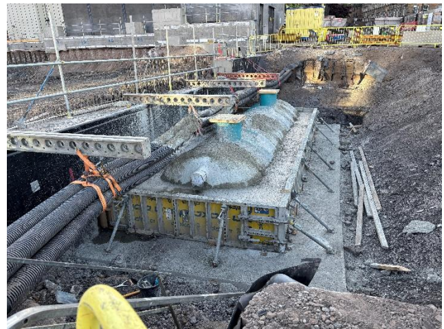
Rainwater harvesting tank cast