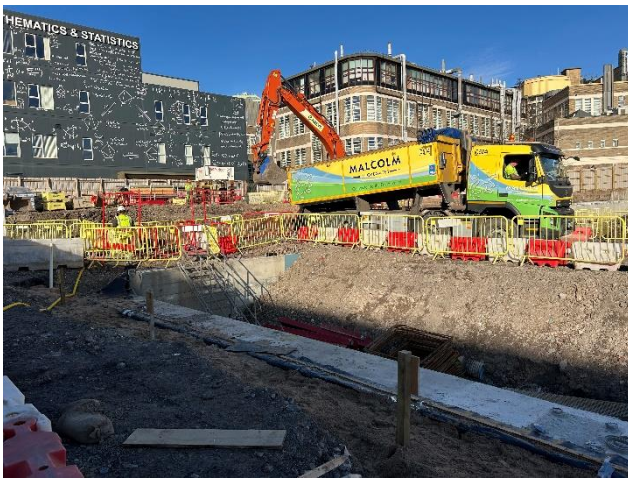
Commencement of excavation works