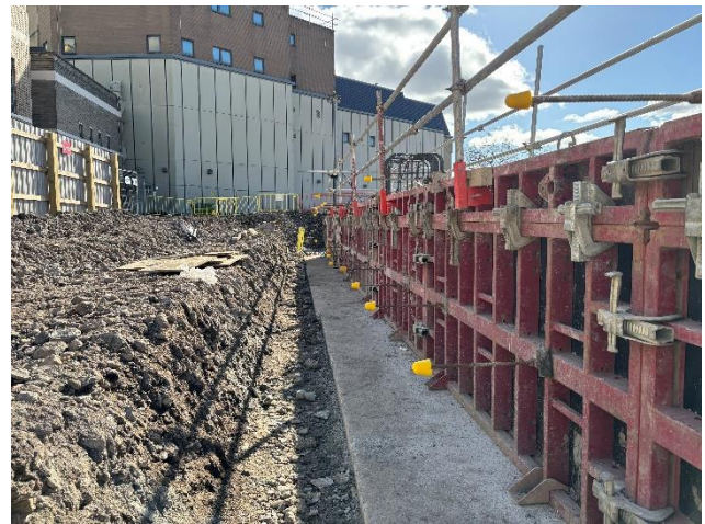
Continued progress of the capping beam