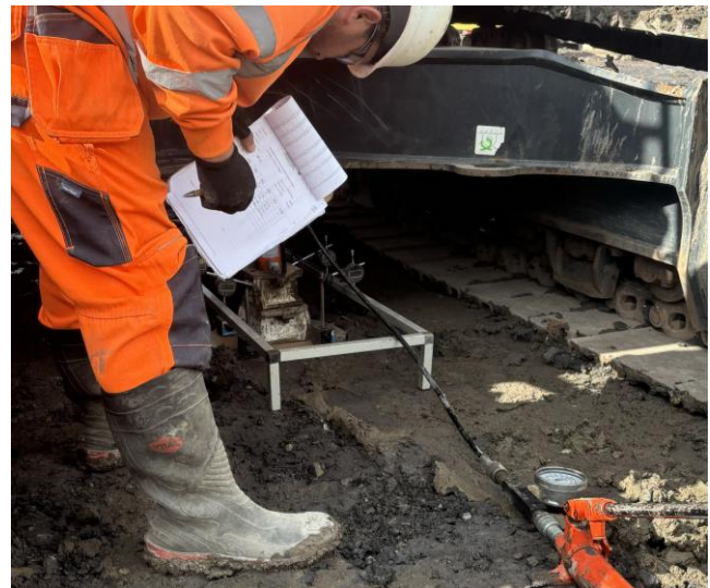
Initial testing of the piling mat