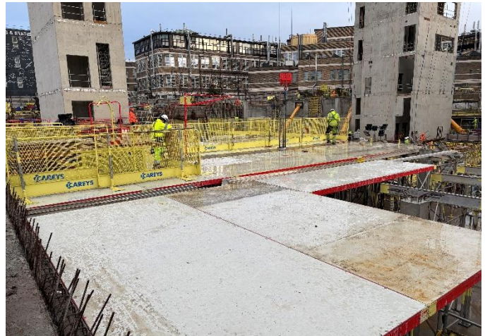
Preparation for suspended floor slab