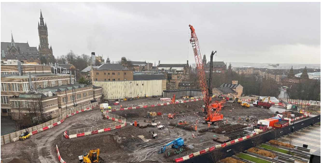
Aerial view of the site