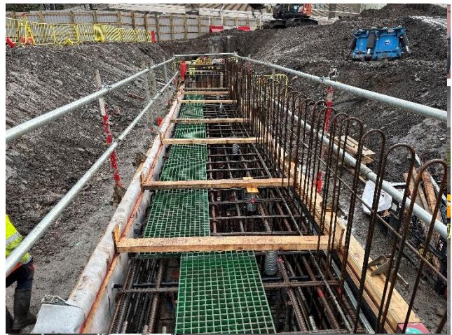
Formwork in place for capping beam concrete