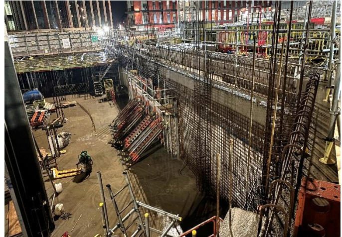
Progression of liner wall in Zone 1