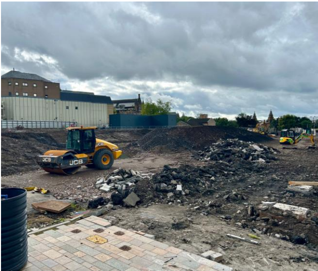
Preparation of the plot including pile mat