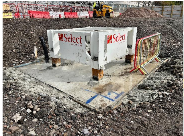
Crane base ready for TC3 installation

We apologise for any inconvenience this may cause.