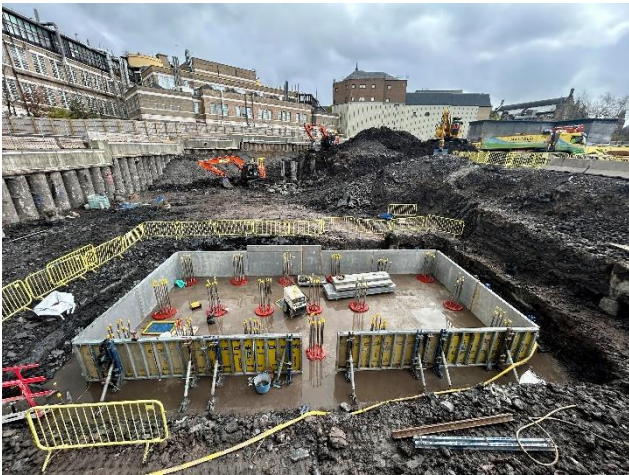
First of the concrete cores