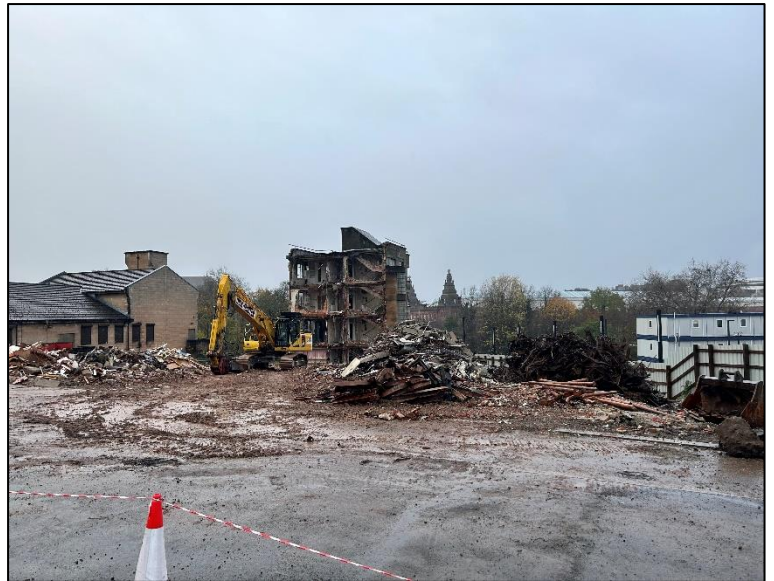
Demolition of the Admin building