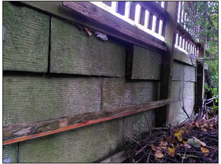
Image (above, right) showing the damage to the wall due to the attached fence being violently shaken and image (below, right) demonstrating the structural bracing that was installed by the team