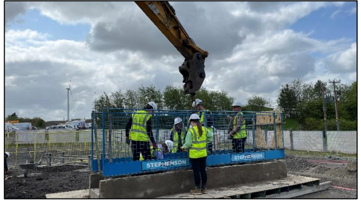
Students at ConStructEd