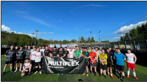
Charity Five-a-side football