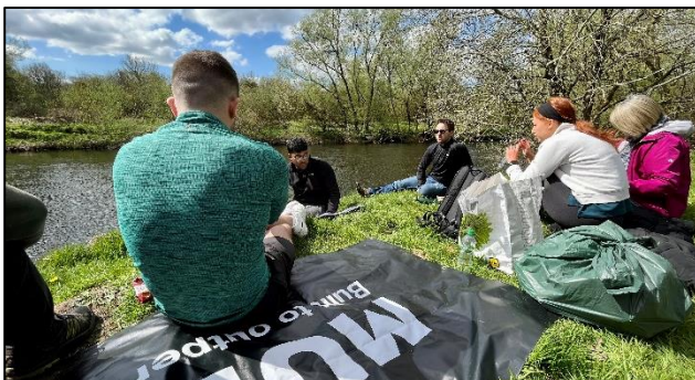
Biodiversity Toolbox Talk