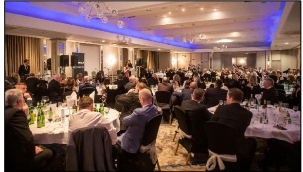
Celebrating Burns Night at the charity ceilidh