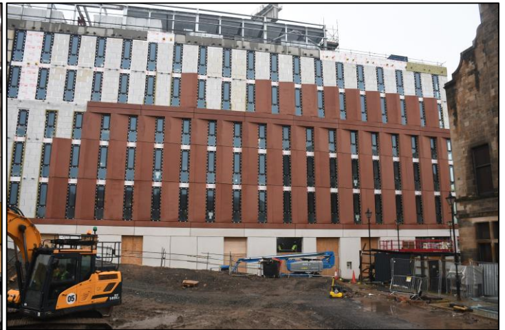
IHW at the final stages