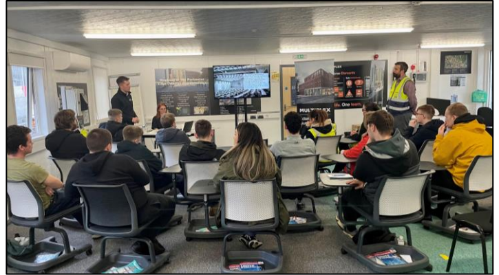
City of Glasgow College students at ASBS