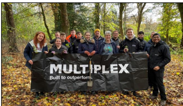
Tree planting at Pollok Park