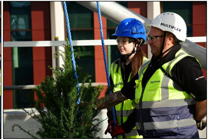
The Adam Smith Business School topping out ceremony