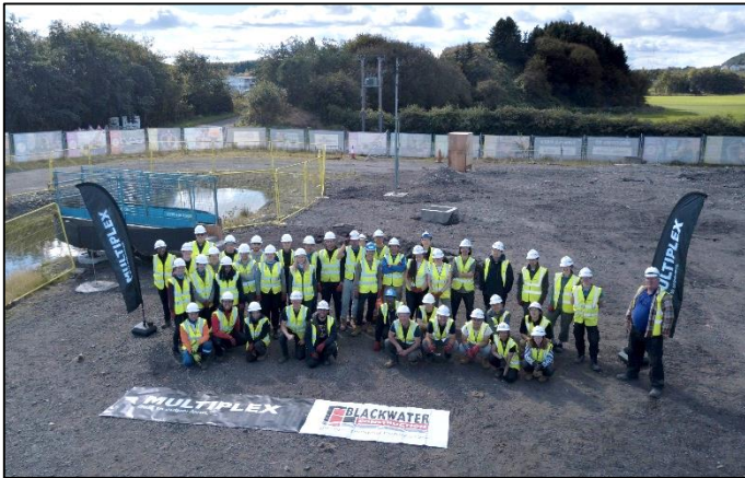
University of Glasgow engineering students at Constructionarium