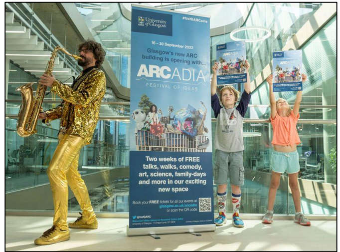
ARCAria celebrated the opening of the ARC