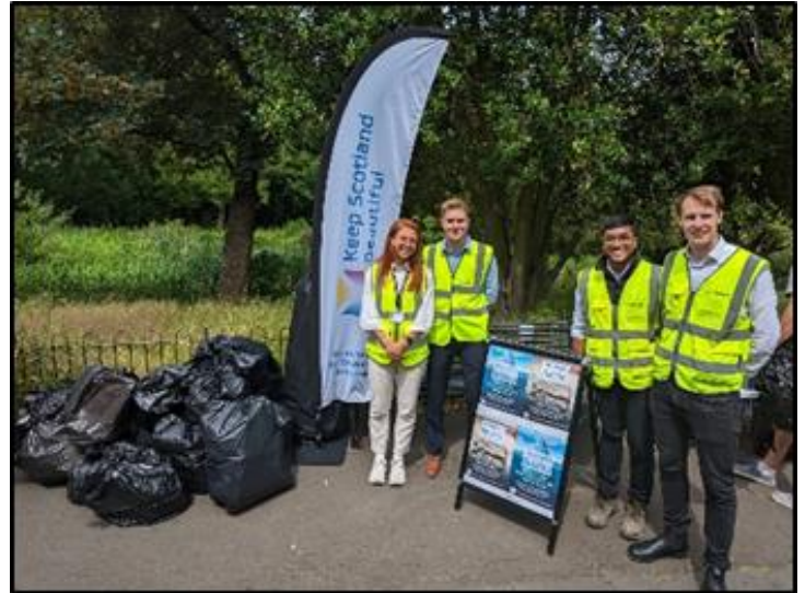
The Multiplex team were in attendance at the Keep Scotland Beautiful litter picking event