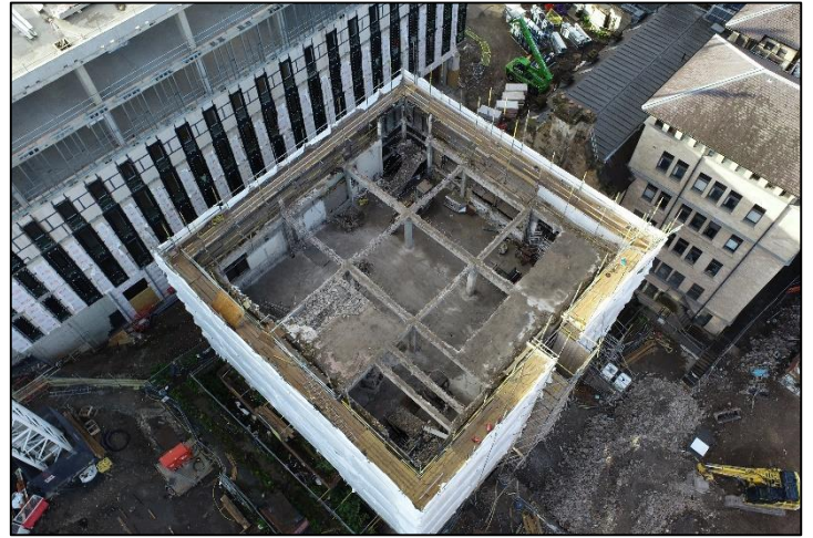
Adam Smith Business School roof-level steelwork and ongoing demolition of the Robertson Building