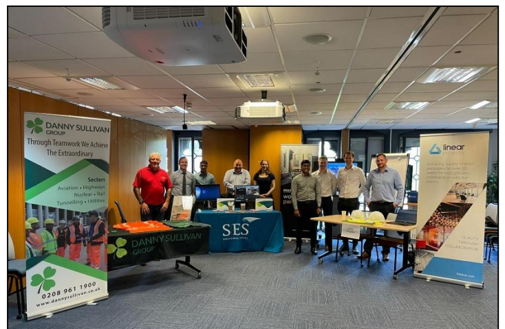
Adam Smith Business School Employment Event