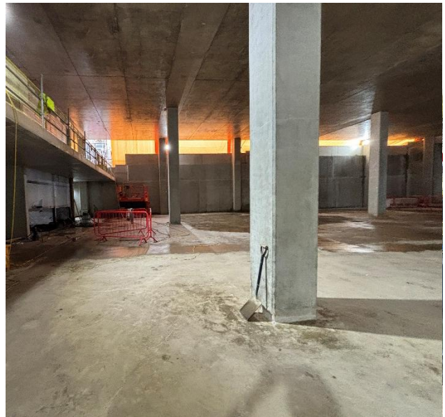
Basement with temporary waterproofing